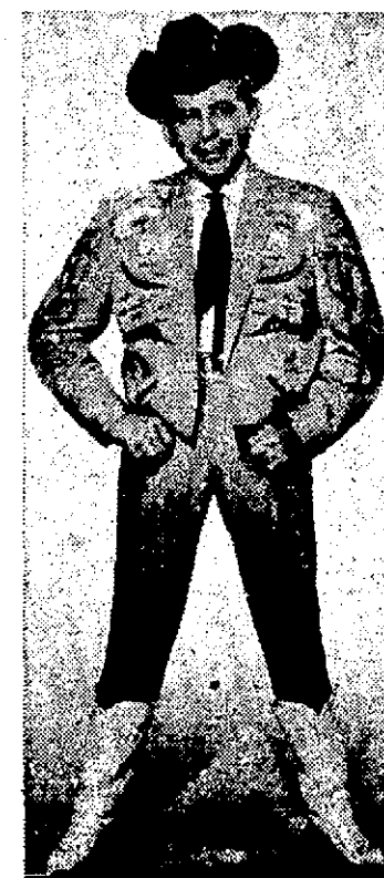
Little Jimmy Dickens & The Country Boys