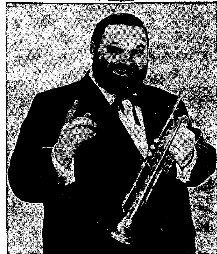
EVENING GRANDSTAND ATTRACTION