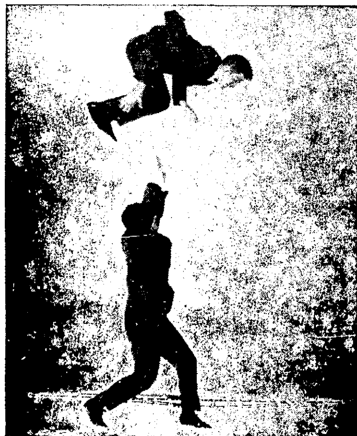
Chase and Park - Comedy Trampoline