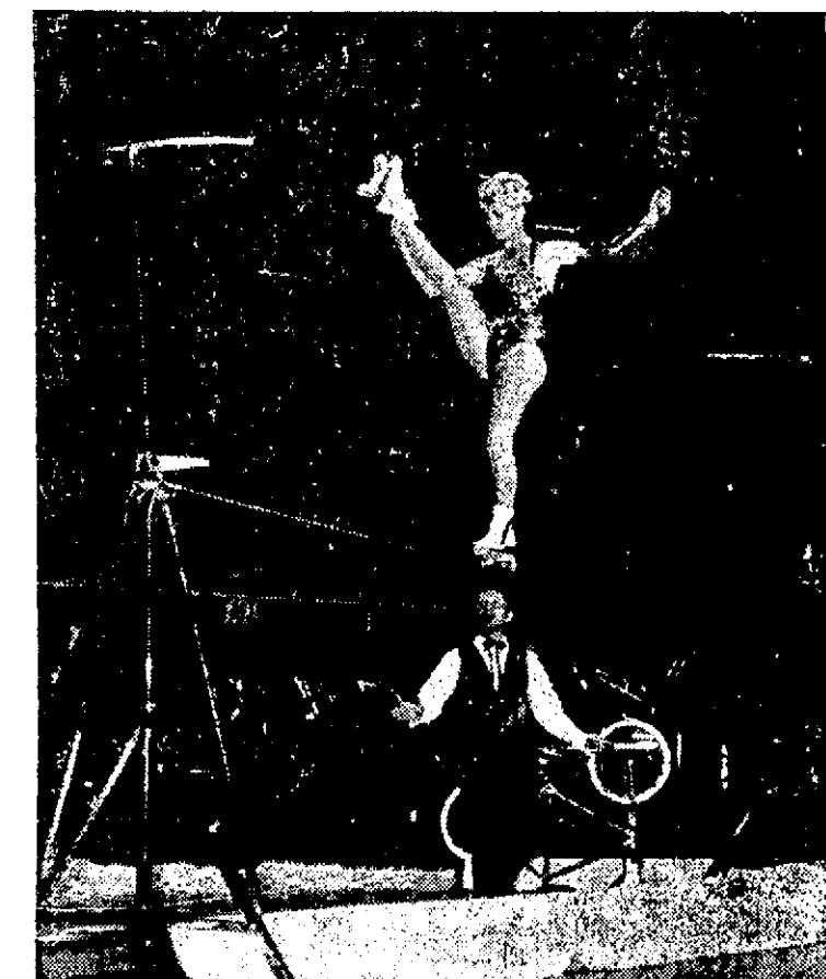
Torreanis - Wire and Pedestal Act