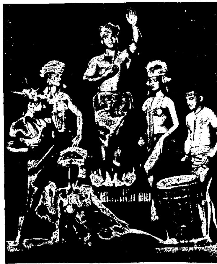
Pearls of Pacific - Novelty Dance